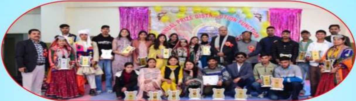
Annual Prize Distribution Function 21st March 2025