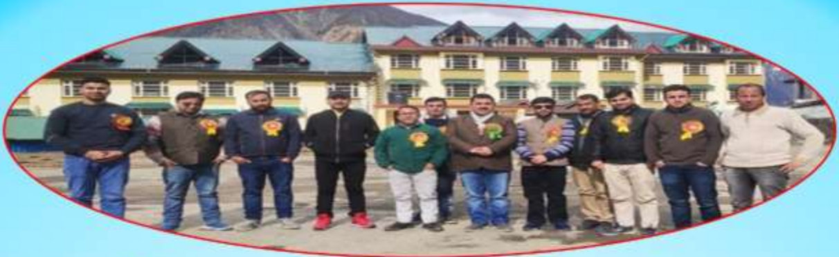
Young & Dynamic Faculty