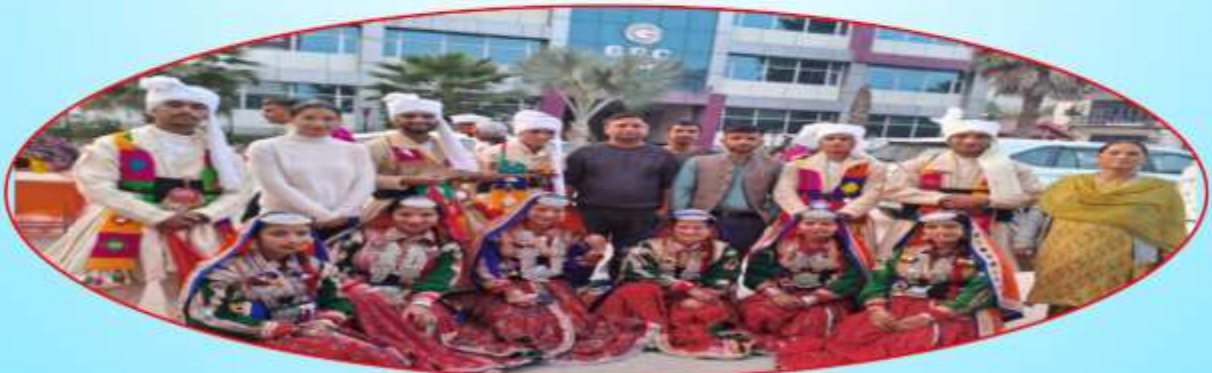
11th Prize in HPU- Group-II